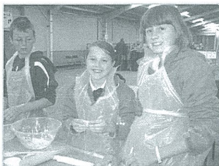
Pupils at Stoneleigh Park, Festival of Harvest

The school will now start preparations for its infant and