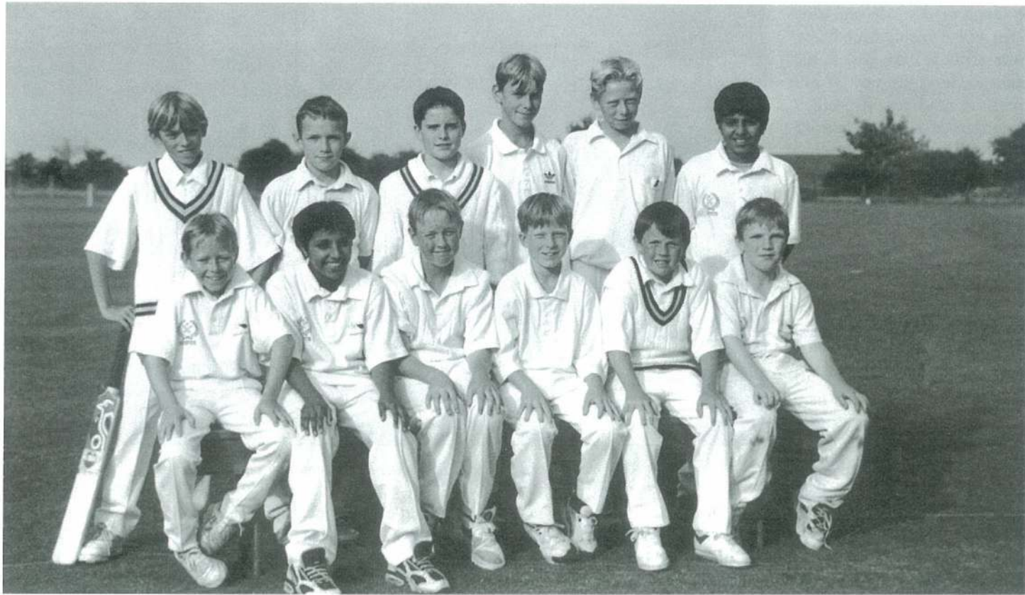
Hunningham Youth Cricket team prior to their final game of the season at home against Studley.

Over the past few years we have been busy developing a junior section at Hunningham Cricket Club. This season has seen the under 11, and under 13 sides establish themselves as forces to be reckoned with in the local cricket leagues. Hunningham juniors attracts a large number of children from the surrounding villages, and Bubbenhall is no exception, with six lads representing the club at different levels. Due to the success of our junior section we have been awarded National Lottery funding. This has enabled us to build all weather training and playing facilities at the ground.