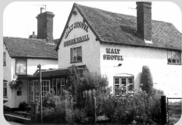
To avoid disappointment we strongly recommend pre-booking