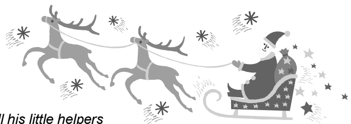
Love Santa & all his little helpers