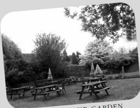
RELAX IN OUR GARDEN

Home cooked food, fine beers & wines, and the beautiful countryside