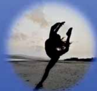
SCSO Dancer

Ballet, Tap & Disco/Street Dance Classes for children & Teenagers (Pre-school Ballet from age 2)