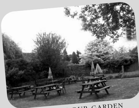
RELAX IN OUR GARDEN

Home cooked food, fine beers & wines, and the beautiful countryside