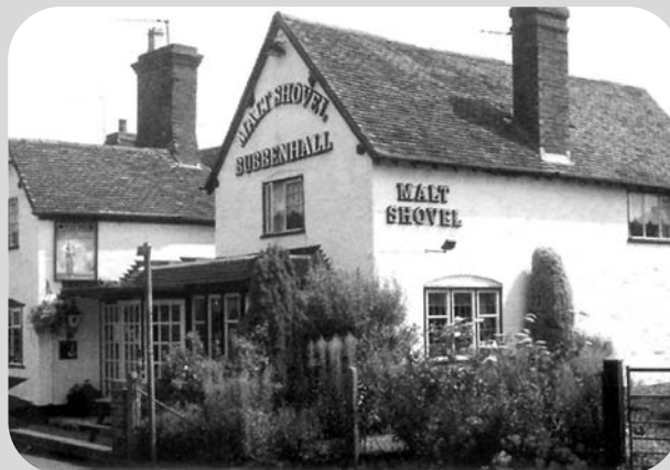
To avoid disappointment we strongly recommend pre-booking