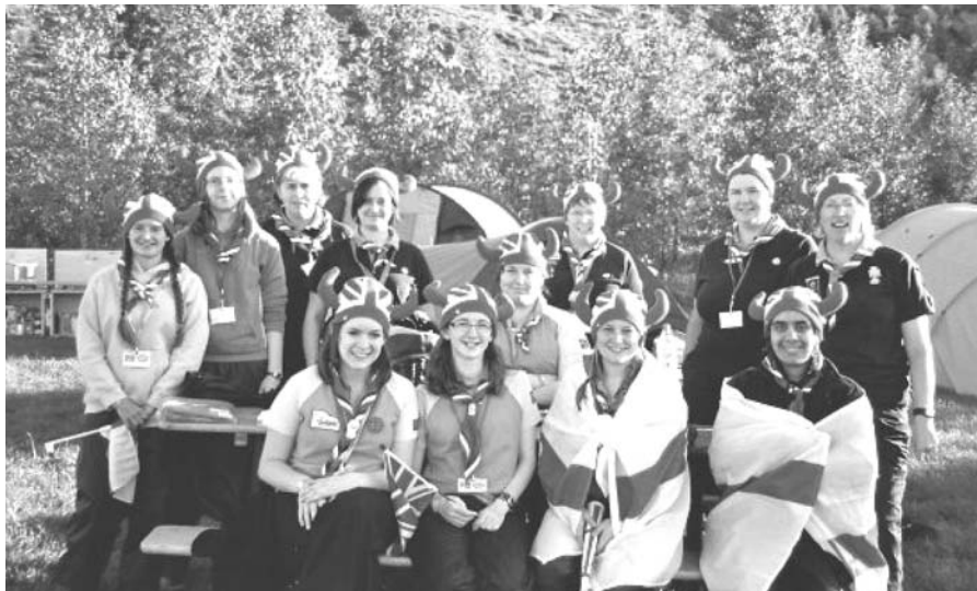
▲ Cubbington Ranger Guides

We are a friendly group and we welcome girls from all faiths and