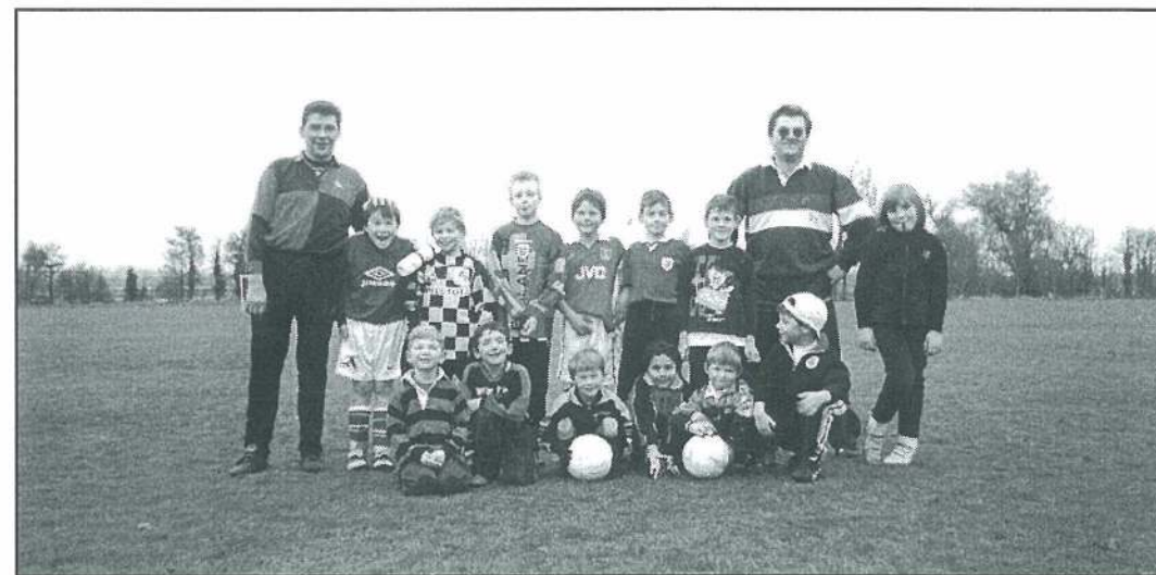
Bubbenhall Junior Football Group