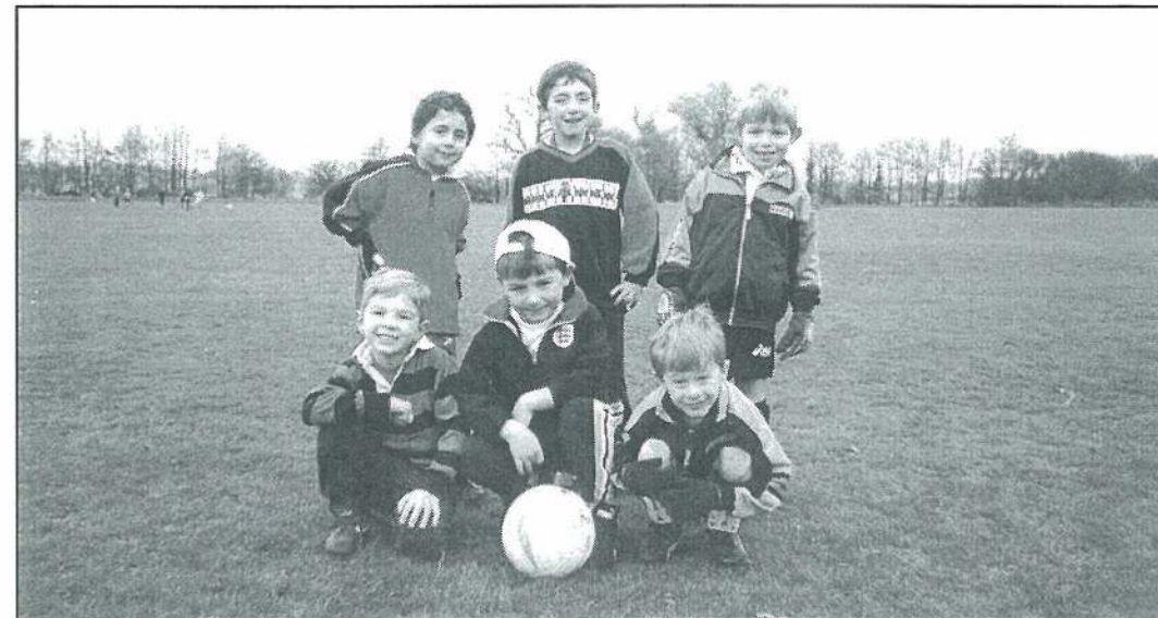
The Under 8 group