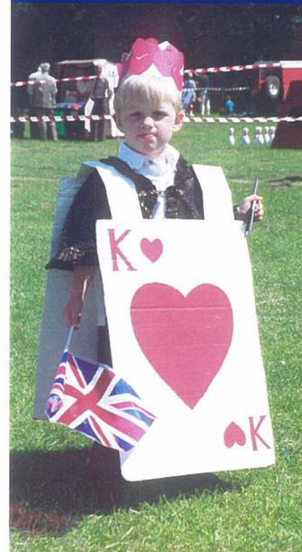
The King of Hearts takes time out from the childrens fancy dress