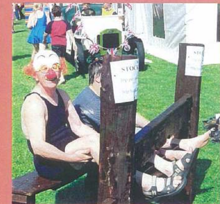
There's clowning around at the water stocks