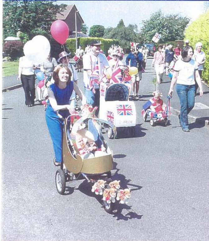
Its not a race but the corgies seem to be in the lead