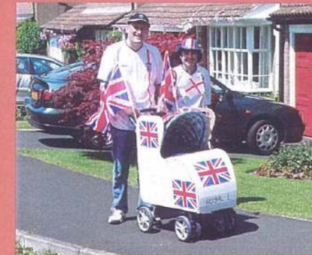
All forms of decorated transport took part in the carnival procession around the village