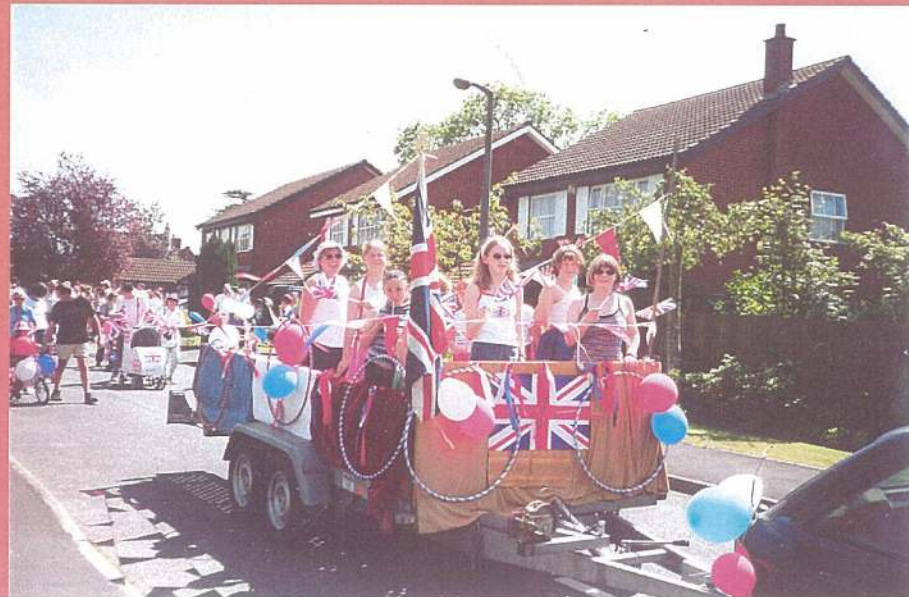
Many enthusiastic children and parents entered into the spirit of the decorated transport competition which added colour and excitement to the parade