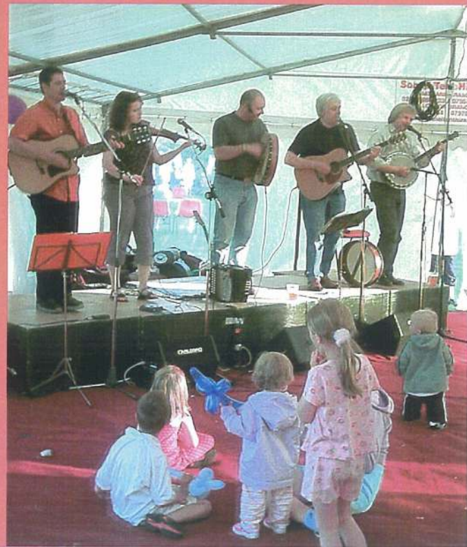
Music and dancing are provided for all ages by The Odd Sods Irish band into the evening and late into the night