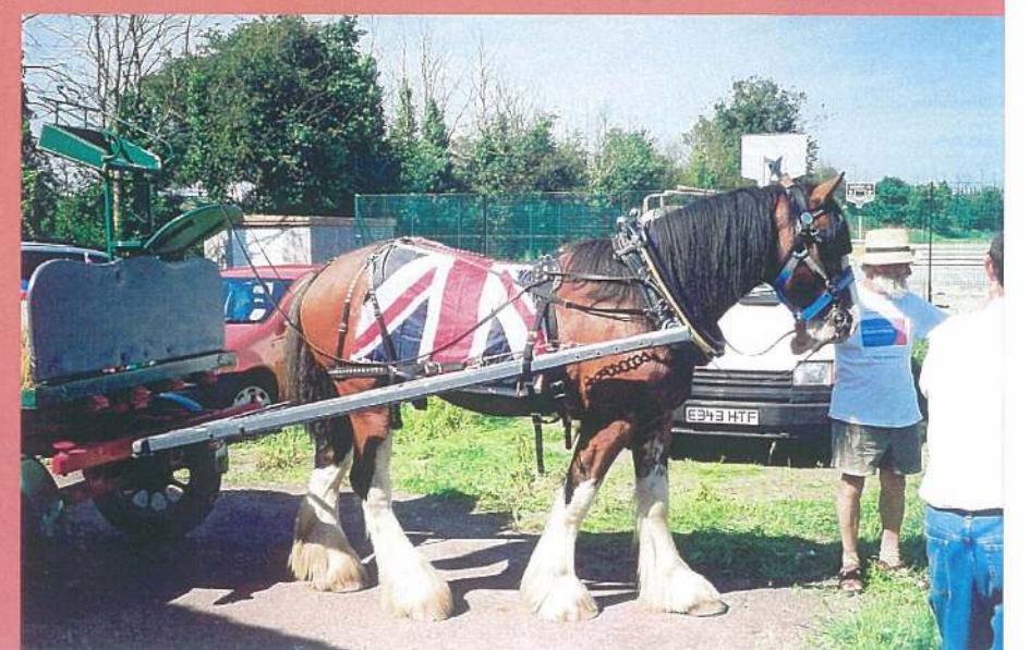
Cart rides around the village playing field are provided by Swallow the shire horse