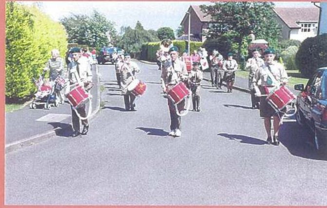
13th City of Coventry Scout Band join the parade