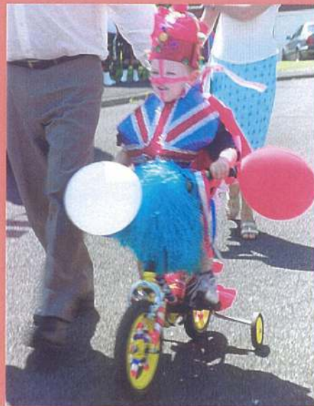
Royal pedal power