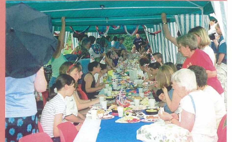
Even the threat of rain can't prevent the children having a great time at the street party