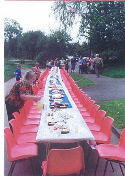
Preparations are well under way for the childrens street party