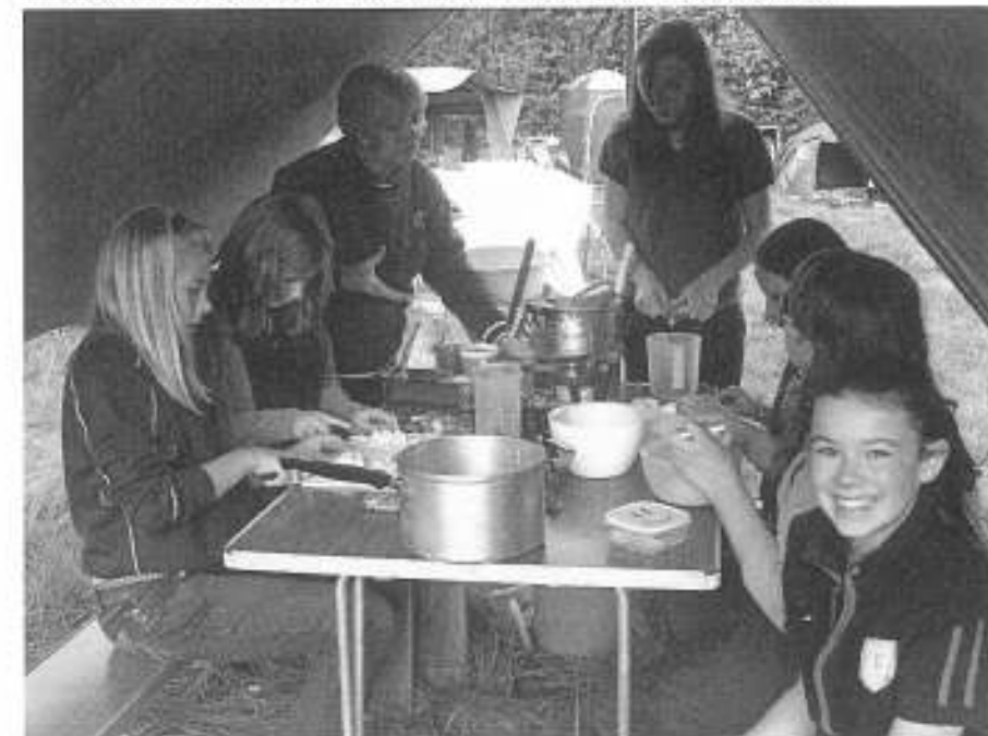
Continued on Page 14 ➤