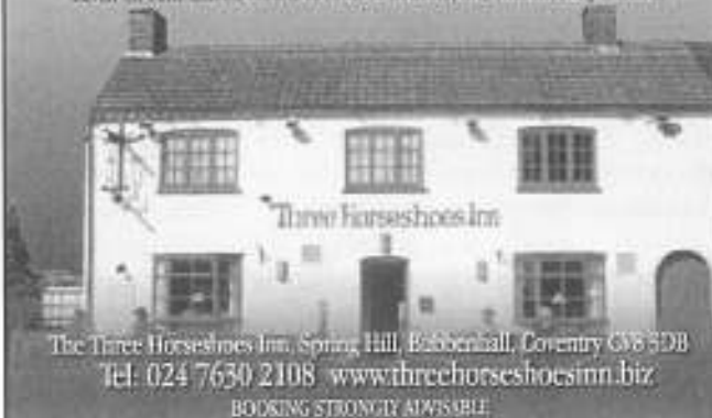
The Three Horseshoes Inn, Spring Hill, Bubbenhall, Coventry CV8 5DB Tel: 024 7630 2108 www.threehorseshoesinn.biz BOOKING STRONGLY ADVISED

Seven on-site chalets mixed of twins & doubles, one with mobility facilities