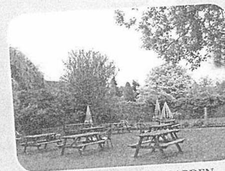
RELAX IN OUR BEER GARDEN

Home cooked food, fine beers & wines, and the beautiful countryside