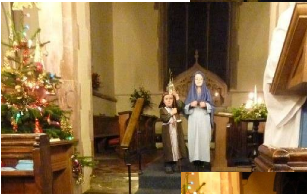
Joseph and Mary