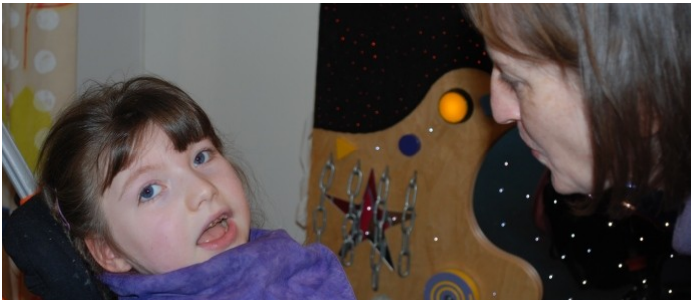
A young guest at Helen and Douglas House.

Your PCC invites you to take a special collection box and / or a Gift Aid envelope from church, or collect your donations in a jam jar from home, to collect cash to help us to support the wonderful work of Helen and Douglas House in Oxford, the first children's hospice in the world. See their website on http://www.helenanddouglas.org.uk/ for an overview of how they support children with life-limiting illnesses and their families.