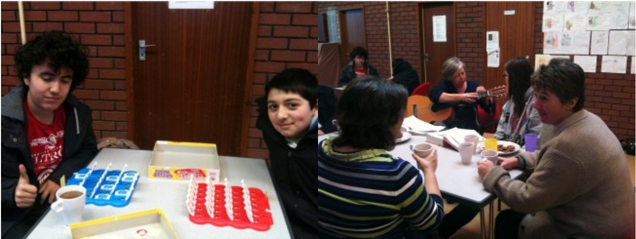
Village worship January 13 th 2013