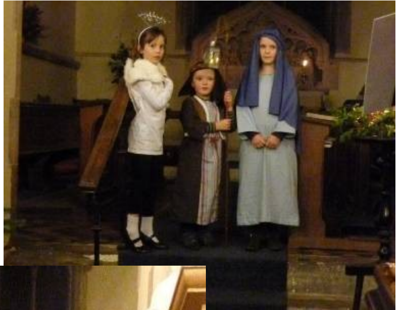
Joseph, Mary and the angel.