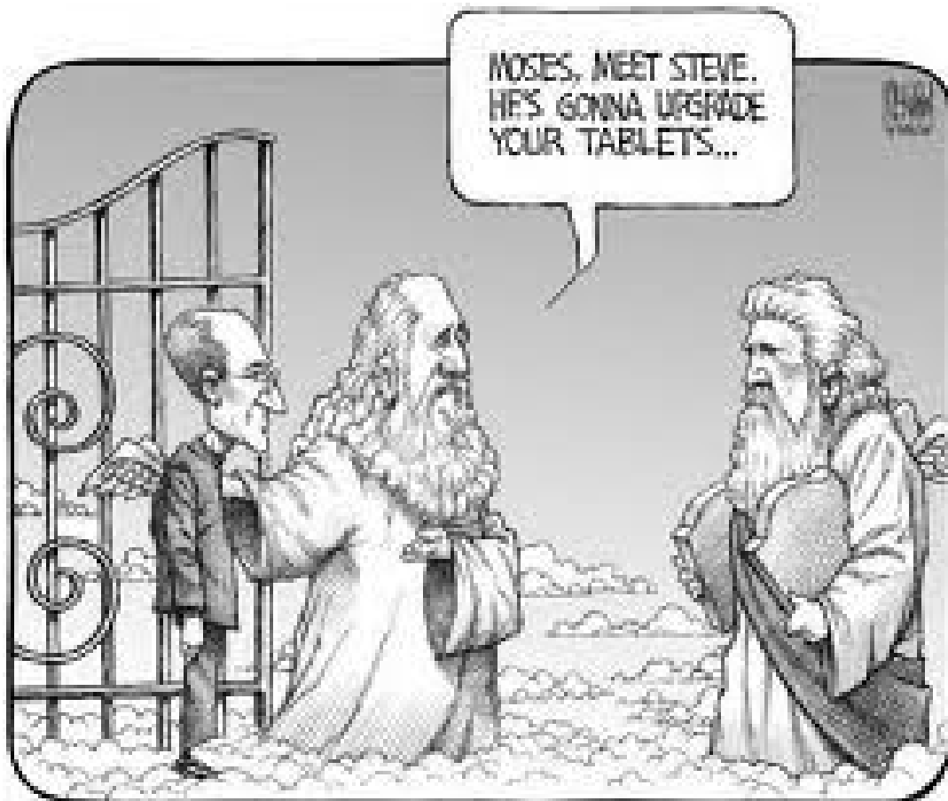
(R.I.P Steve Jobs, co-founder, chairman, and CEO of Apple Inc.)