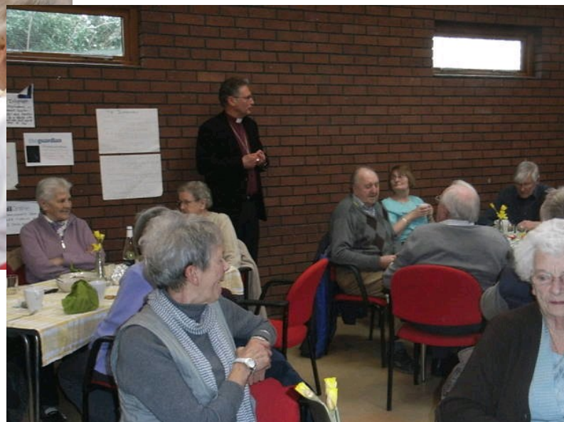
The Bishop spoke to us after lunch.