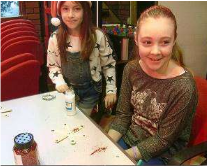
At the Advent Workshop and Village Worship service, we had fun getting ready for Christmas.

Second and Fourth Sunday in every month at 9.30 a.m..