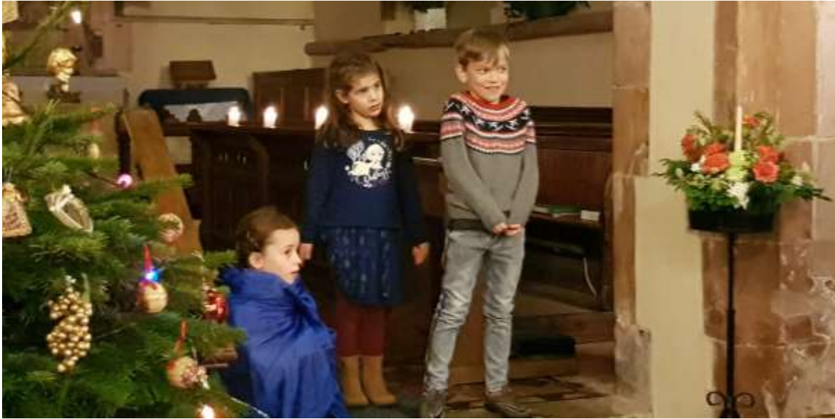
Mary, the Angel, and brave Joseph!

It was lovely to welcome so many children and their families to the Crib Service on Christmas Eve. Thank you for your generous contributions to the collection, as a result of which the Children's Society will benefit from a donation of £160.42 , including the tax refunded by the Gift-Aid scheme.