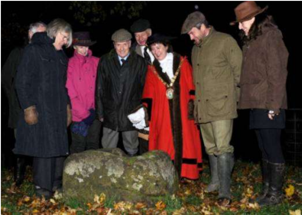
Wroth Silver ceremony 2012

All will then return to The Queens Head for a breakfast and speeches. Please note that breakfast tickets need to be pre-booked directly with the Queens Head, (breakfast cost was £13 in 2014. Included in the price is a glass of rum and hot milk with which to toast the health of His Grace and a churchwarden pipe (tobacco supplied). People will be departing by about 8.45am. Further information on : http://www.wrothsilver.org.uk/