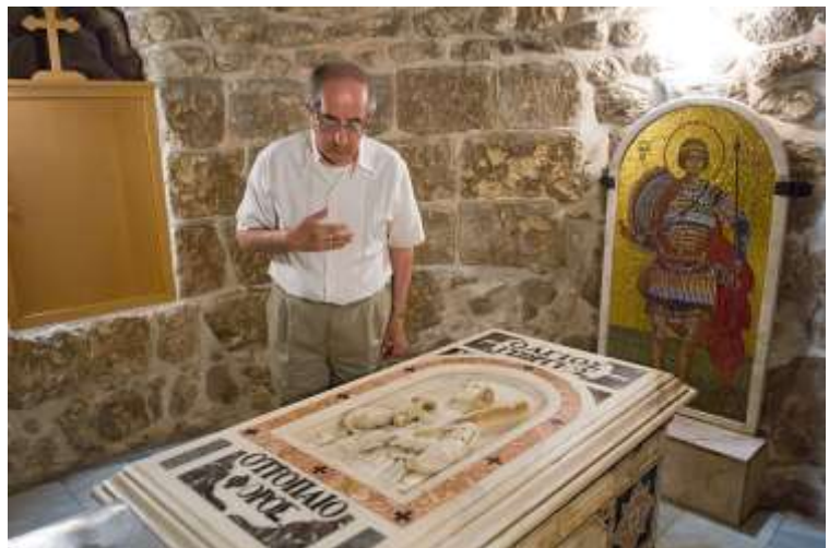
Tomb of St George, Lydda, Palestine.

Christians of all traditions, and also some Moslems, still make pilgrimages to Lydda to honour St. George.