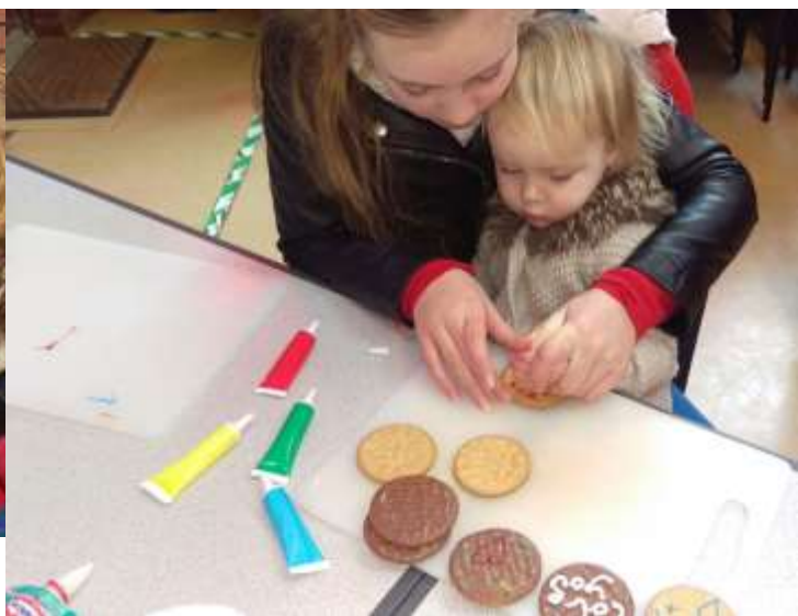
Fun at Village Worship, February 14 2016